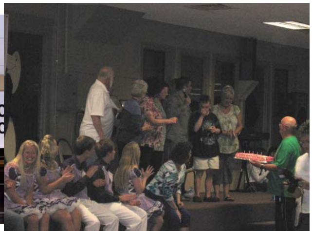
Celebrating birthdays and a 50th wedding anniversary—the couple honeymooned at Fontana!