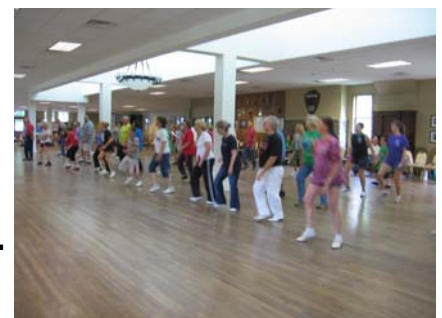
Wood floors! A clogger's best friend!

Make plans to experience the aura of the Fontana Jamboree next September.