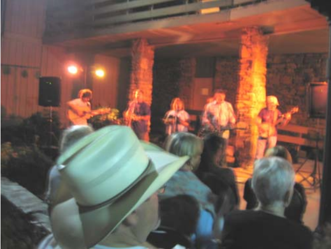
The Grass Stains perform poolside on Friday evening.