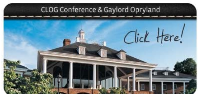
Gaylord Opryland Resort & Convention Center | Nashville, Tennessee

(or go to www.clog.org and click on Convention)