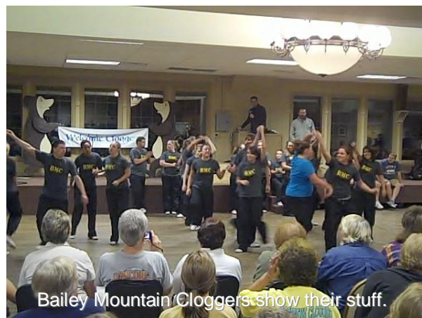
Bailey Mountain Cloggers show their stuff.

EVACUATE THE DANCE FLOOR WAS SCOTTY'S RESPONSE AFTER BARRY'S RELEASING A TIGER BY THE TAIL