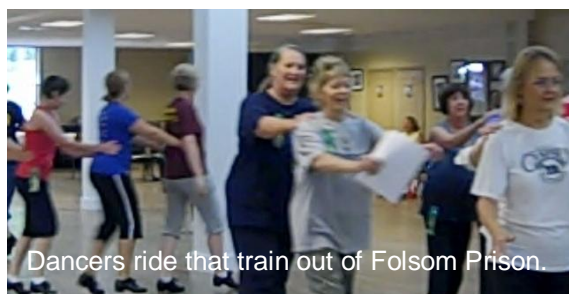
Dancers ride that train out of Folsom Prison.

THE SPRAWLING MAIN DANCE HALL ALLOWED ROOM TO TRY A SYNCO DE DRIGGO OR A WASUP JUMP BACK