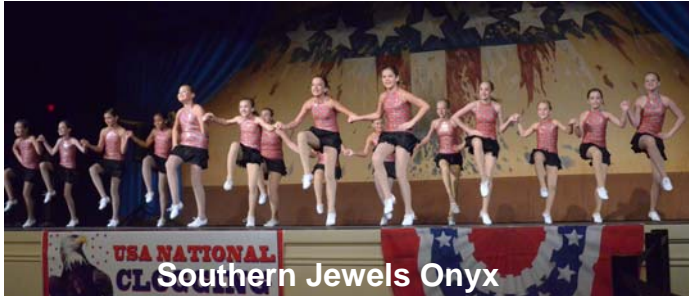
Southern Jewels Onyx

On behalf of the CLOG, The National Clogging Organization, we thank each dancer and leader for their support.