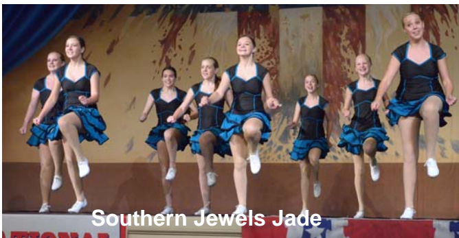
Southern Jewels Jade