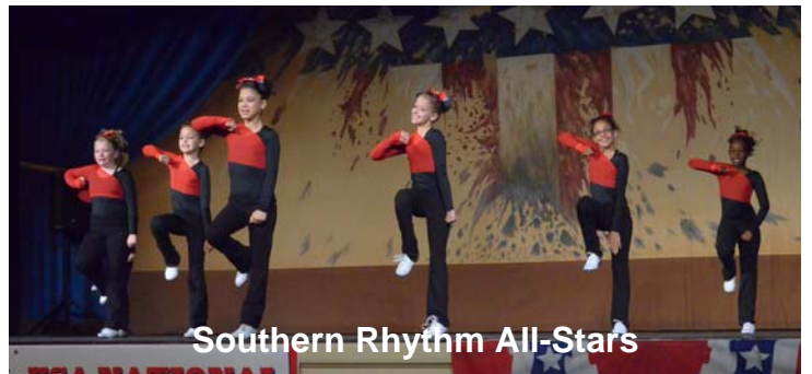
Southern Rhythm All-Stars