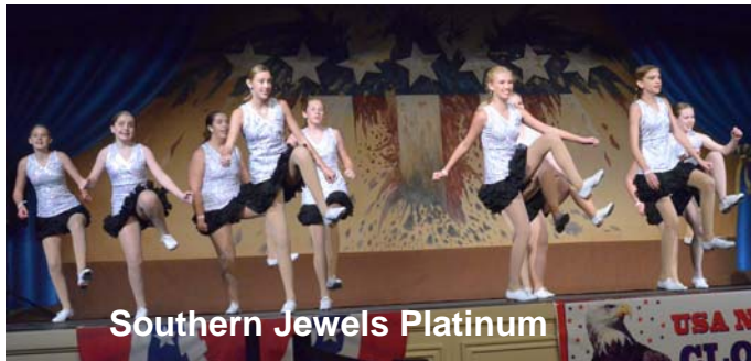
Southern Jewels Platinum