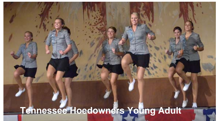
Tennessee Hoedowners Young Adult

Look for the All Star teams and more photos in our next issue!